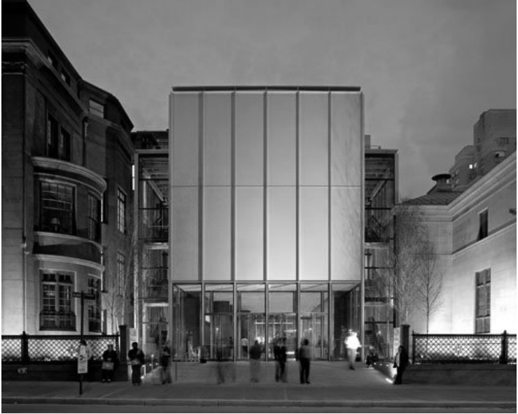
The Morgan Library & Museum